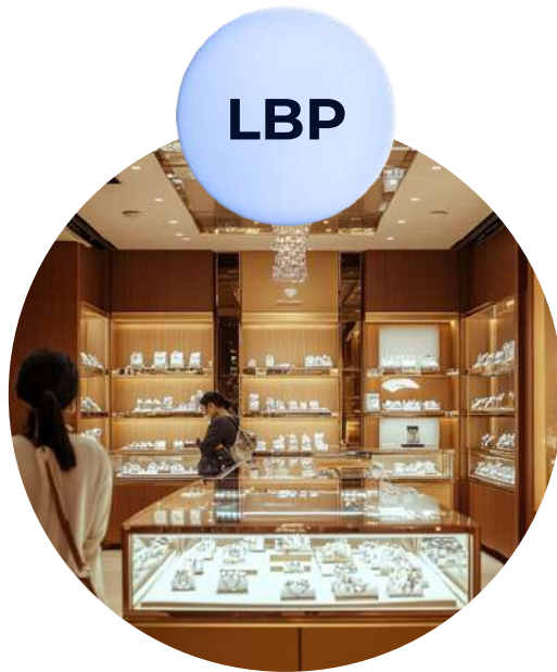
Luxury Business Partners

With our three powerful business units , we empower luxury brands to reach their full potential and beyond.