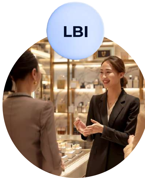
Luxury Business Institute

Winning brand strategies & seamless management