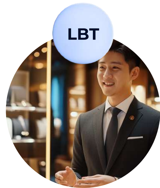
Luxury Business Talent

Training and customer service & experience (CS & CX)